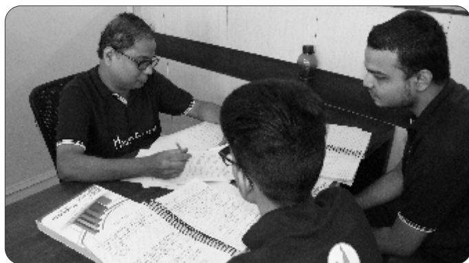
SPECIAL DOUBT CLEARING